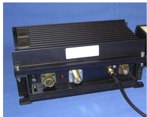
8 Watt Video Transmitter